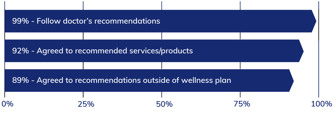
Increased Overall Compliance in Wellness Plan Programs

Well-implemented wellness plan programs can produce 10% revenue growth for a practice in the first year — and almost triple that in three years or less. Owners with pets in Covetrus managed wellness plan programs schedule more visits and follow nearly all of their veterinarian's recommendations.